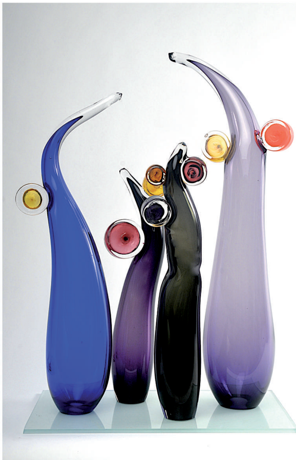
1. Reine des Poissons Armchair , 2017, 120 x 80 x 60 cm, blown glass, stainless steel, photo by I. Tabelion