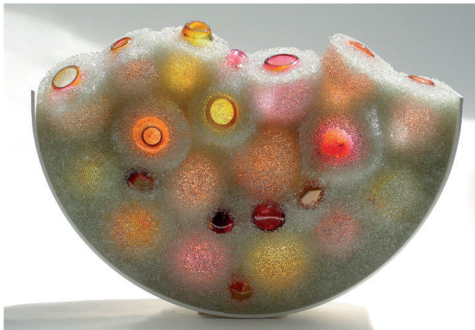
14. Fil Conducteur, 2007, 150 x 35 x 6 cm, blown glass, nickel plated steel, photo D. Fona